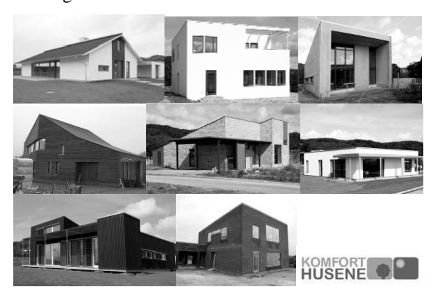
Figure 1: Overview of the Comfort Houses that fulfils the German passive house standard [1].

directly from Germany or Austria to Denmark because the requirements to a Danish lifestyle, the traditions in the building industry and the architectural traditions are different. Therefore it is important to find at Danish approach, to get passive houses into the Danish market and thereby minimize the energy consumption in housing.